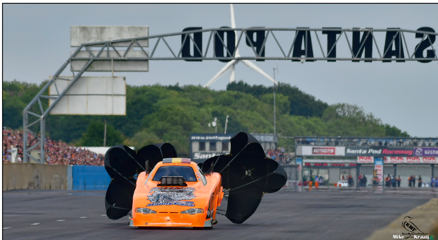
Team Bellio a Dragracing family from Belgium going for the 2025 FIA Championship

And recording a 3.667 ET. Incredible achievement from Force Racing.