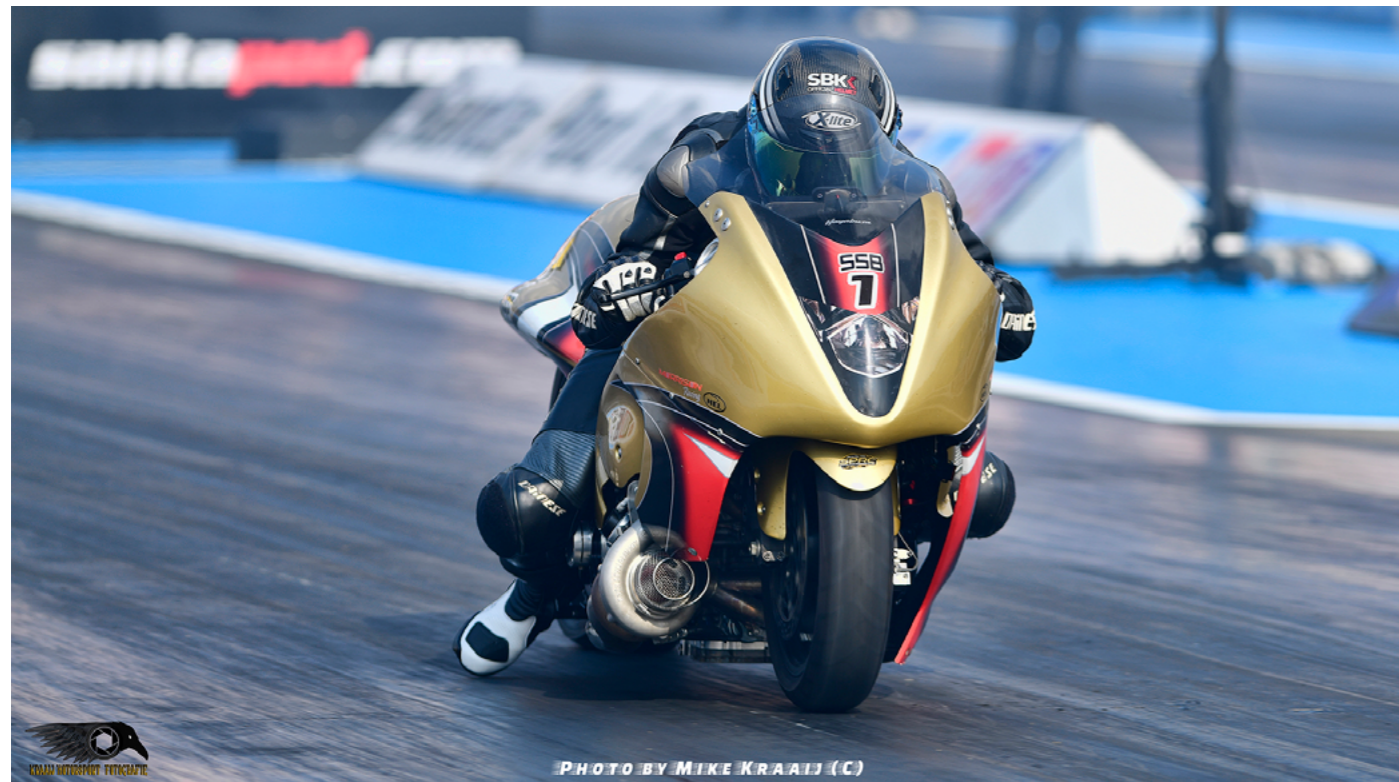
FIM-E Super Street Bike Racer Alan Morrison from UK is the back to back European Champion!