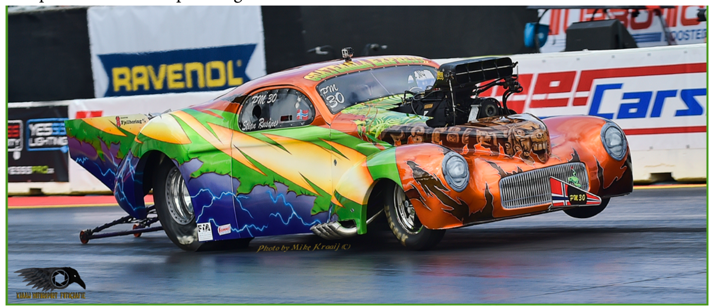
The immaculate Guatemala Express from Norway going strong at the 2024 NitrolympX!

His Guatemala Express in the form of a 1941 Willys is a great looking Pro Mod and strong competitor with his Supercharged Methanol 521 V8.